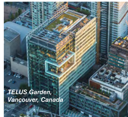
TELUS Garden, Vancouver, Canada