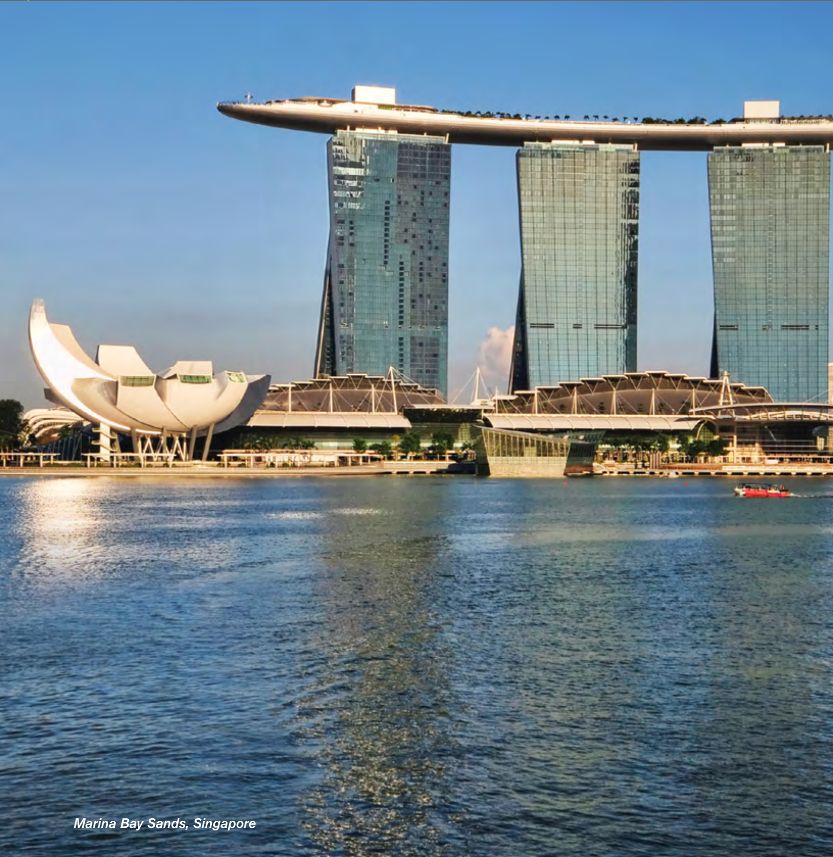
Marina Bay Sands, Singapore