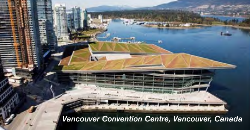
Vancouver Convention Centre, Vancouver, Canada