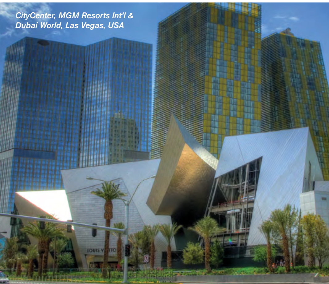
CityCenter, MGM Resorts Int'l & Dubai World, Las Vegas, USA

Kryton's Smart Concrete® solutions contain proprietary technologies that allow concrete to respond to its environment to protect itself against water penetration and corrosion, or erosion and abrasion. Since Kryton products waterproof and harden from the inside out, they create either a permanent waterproof barrier stopping the transmission of water or increase concrete hardness to dramatically extend the structure's service life. Kryton also works from the outside in, it waterproofs cracks and improves the durability of concrete structures. Our products are demanded in over 50 countries, from Canada to China, India to Indonesia, the UAE to the USA.