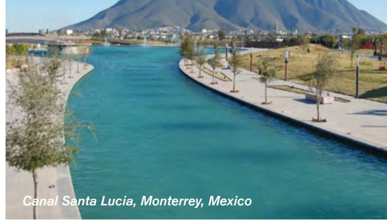
Canal Santa Lucia, Monterrey, Mexico