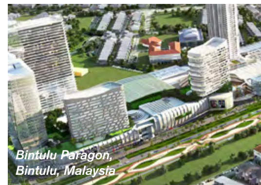
Bintulu Paragon, Bintulu, Malaysia