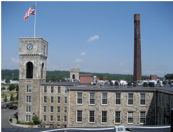
Royal Mills Riverpoint Apartments, West Warwick, Rhode Island, USA