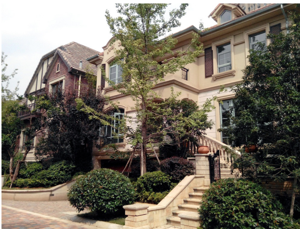
American Dream Development, Changsha, China