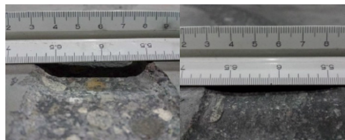
Fig. 4: Horizontal shotcrete test panels after abrasion test (control - left. Hard Cem - right.) Profile view of wear depth.