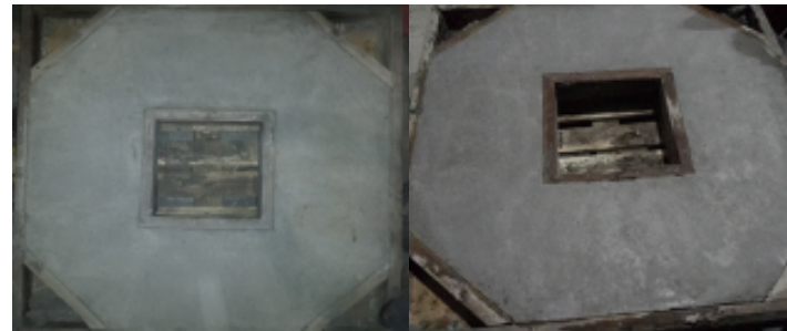
Fig. 2: Horizontal shotcrete test panels before abrasion test (control - left. Hard Cem - right.)