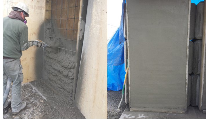
Fig. 1: Vertical test panel shoot